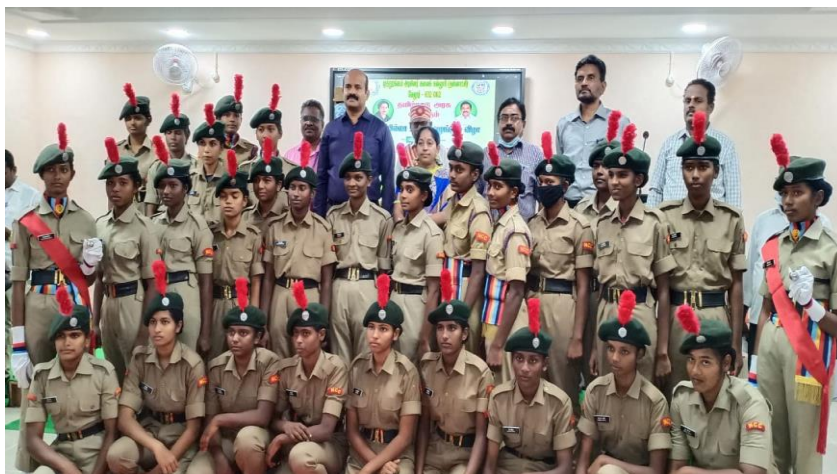
Women's NCC Unit with District Collector of Vellore