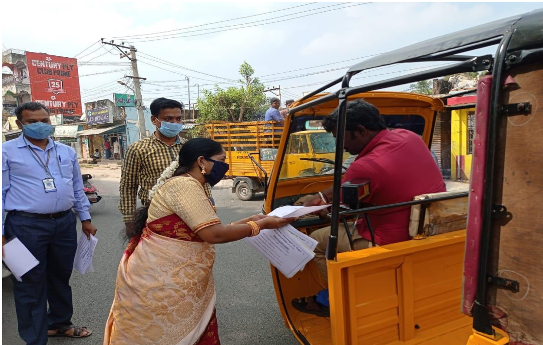
Photographs show the Principal campaign on Road Safety