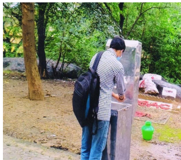
Photographs show the precautionary measures for COVID-19 on the World Hand Wash Day