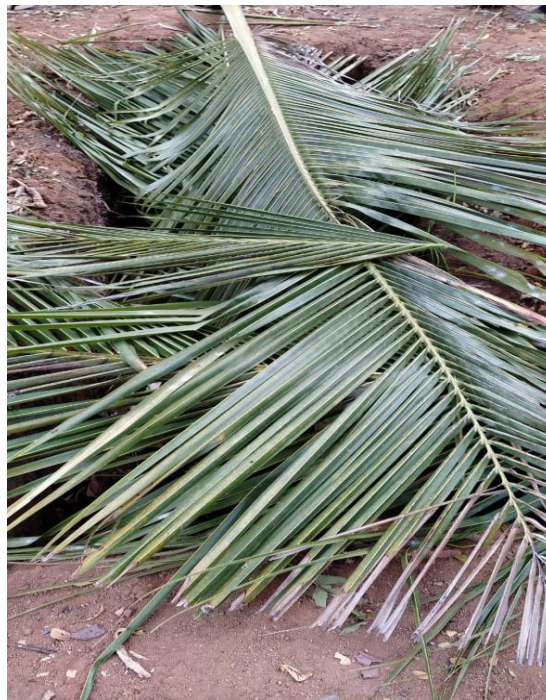
Photograph shows the stage by stage development of Vermi composting which is developed for the first time within the college campus