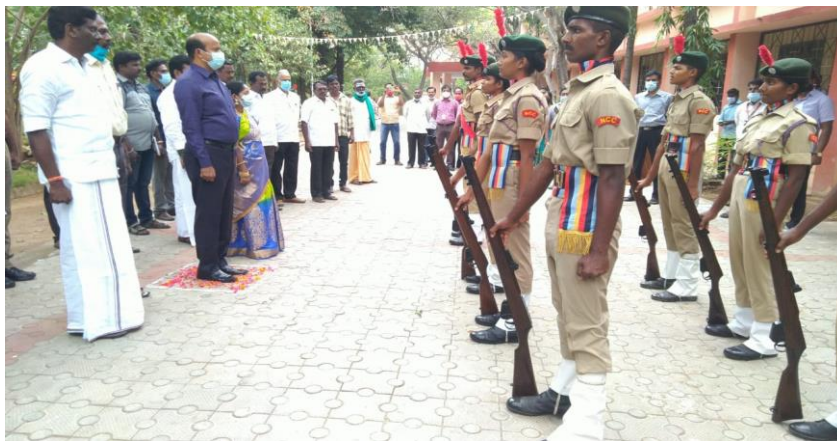
Guard of Honour to District Collector of Vellore