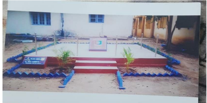
Photographs show the College playground/campus after COVID-19 lockdown and NCC flag hosting area developed by NCC cadets.