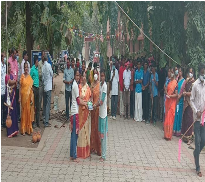
Photograph shows silambattam and karakattam during Pongal festival