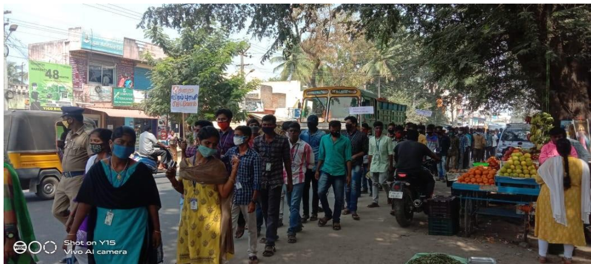
Photograph shows the Voters awareness Rallies