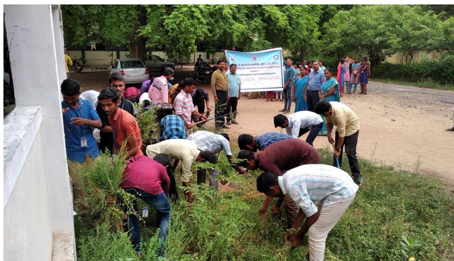
Photograph shows the NSS Activities