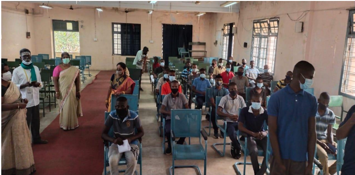
Photographs show the COVID-19 vaccination camp