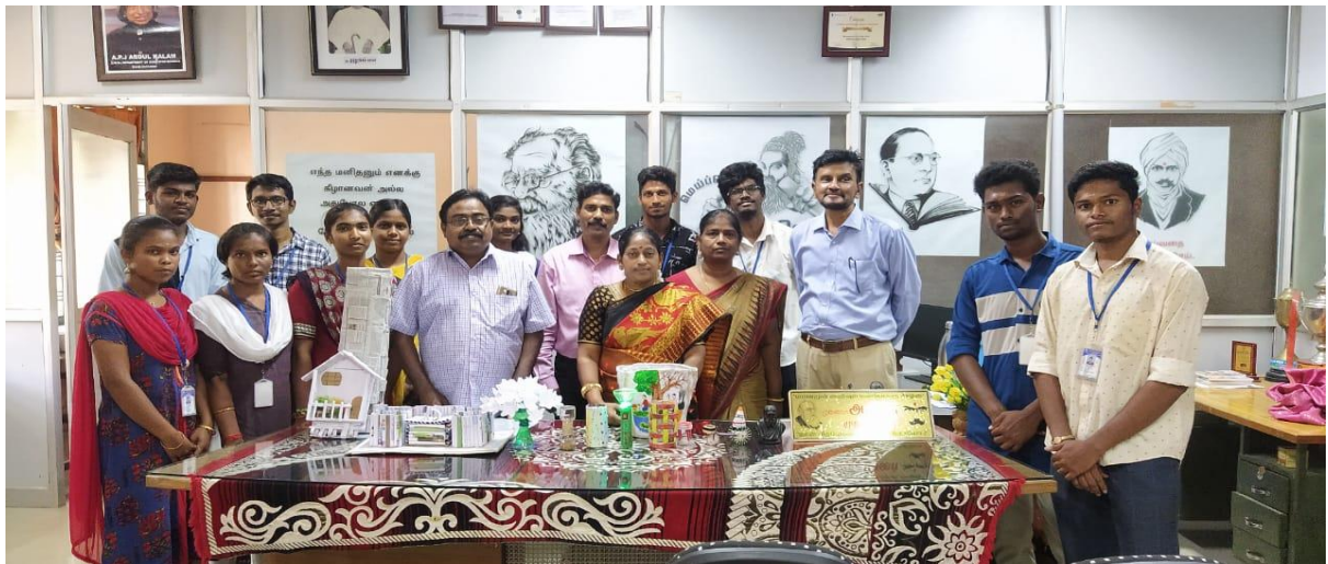
Photographs show the different decoration and day-to-day life useful items prepared by the students from solid and e-waste materials