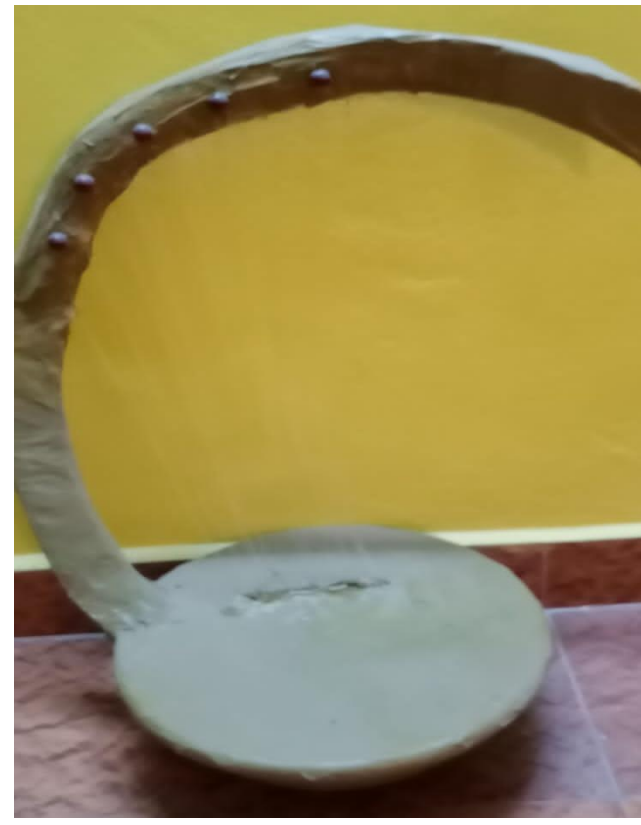
Photographs show the ancient and traditional musical instruments prepared by the students from waste materials like paper, cardboard, bamboo stick bowl and