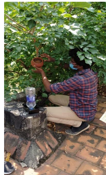
Photograph of Birds - Clay Pot Nest together with feeding setup from plastic waste.